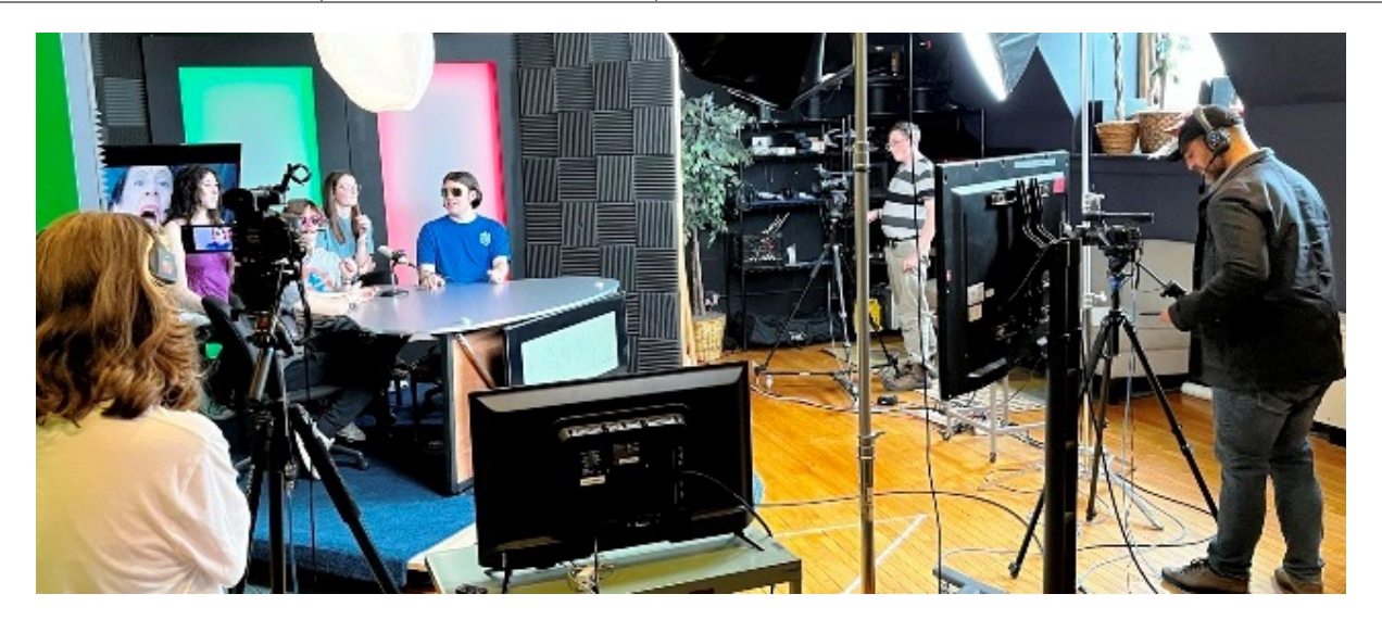
Students from the Windham Regional Career Center Film and Video Studies program produce a talk show in BCTV's studio.