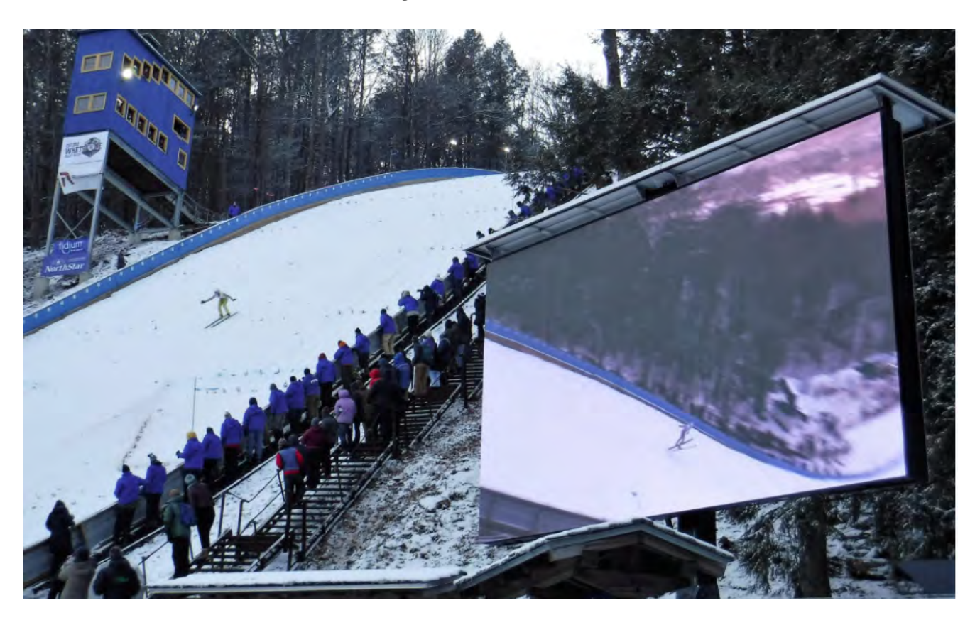
BCTV's 4-camera production of the 100th Harris Hill Ski Jump was simulcast to a Jumbotron for thousands of attendees to enjoy, along with being livestreamed on Facebook and Comcast.