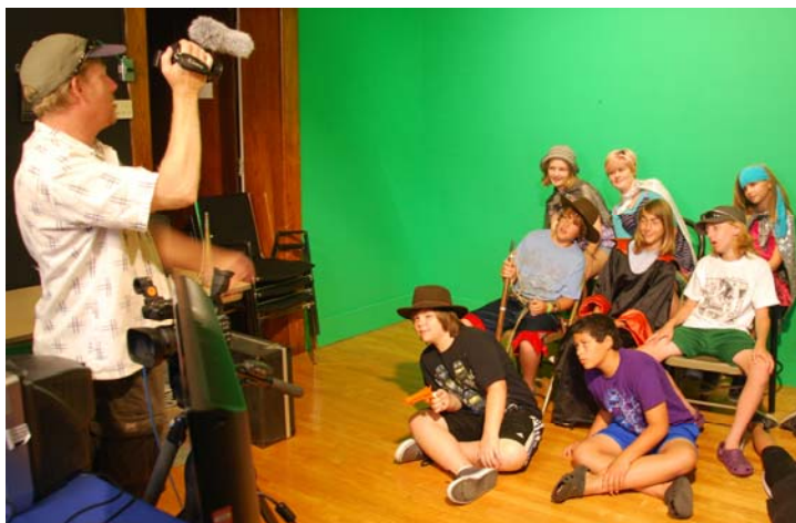
Campers go on a wild ride in front of the new green screen.

Summer Youth Video Camp –The 2012 week-long session had 11 campers, age 9-12, who created a '80s-themed video called "The Time Traveling Trio." This popular program has kids filming all over downtown Brattleboro and they end the week by releasing their premiere live on Channel 8.