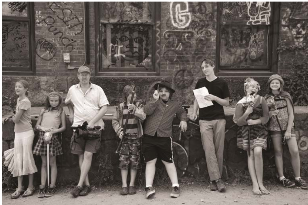
Above: 2012 video campers and staff relax on the set while filming "The Time Traveling Trio." Last summer's camp video "Double Trouble" won a national award for Original Teleplay from the Alliance for Community Media.