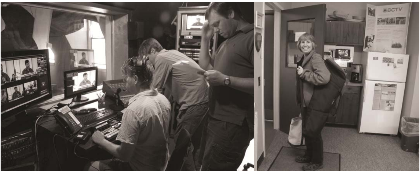
Left: Staff set up the new switcher for Selectboard meeting.