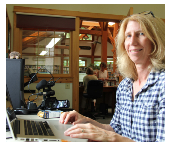
Above: Testing the live stream at the Putney Public Library

BCTV's goals this year were more subtle than in past years, but their implementation was just as critical to our development as a station. The top priority was finishing the renovation project initiated last year when we gutted our studio space and installed the equipment and infrastructure for HD production. This year's focus was less about behind the scenes and more about what viewers would see. With a small budget in hand, we started by purchasing a 70" flat-screen monitor as a set piece, and designed custom backdrop panels that are internally lit and can change color with the push of a button. Accent lights created highlights and texture. The next step in lighting will be replacing our decades-old Tungsten fixtures with LEDs and fluorescents.